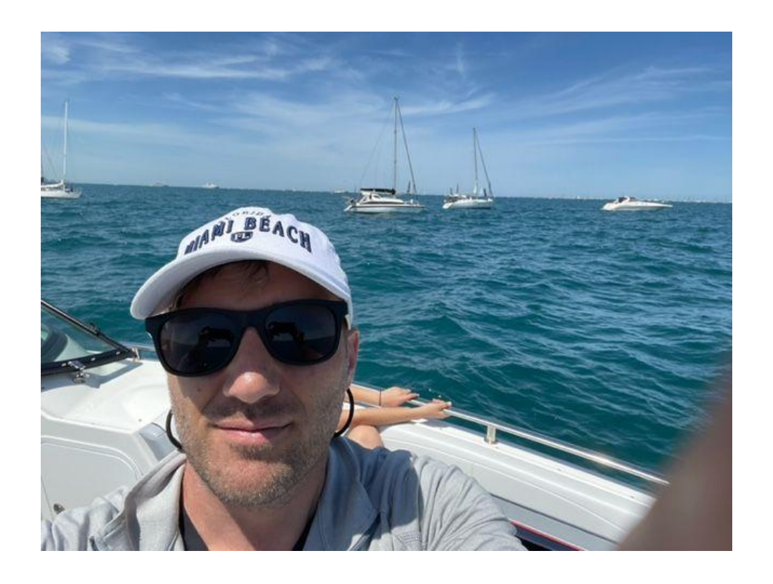
"Excellent and responsive broker. Highly recommended."

It's actually really simple. Some have been surprised by those we have cut ties with, but most understand our unwavering desire for this dream to not turn into a nightmare. If your presence, or your actions, pose a risk to this dream...be sure that you'll be cut out as well. We've built a neat little machine that pumps out joy...and we'll protect it at all costs. What that means for our customers is that their interests will be protected at all costs as well. There is no air between our interests and those of our clients.